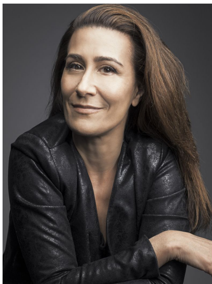
Jeanine Tesori.