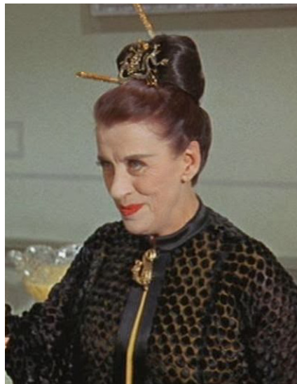
Beatrice Lillie as Mrs. Meers in the Thoroughly Modern Millie film