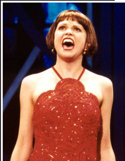
Sutton Foster as Millie on Broadway